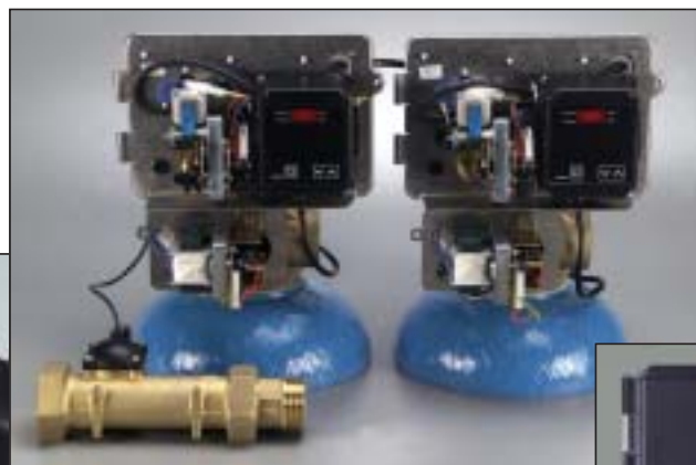
▲ 3200NT CONTROLLER WITH 2900 VALVES AND AN ELECTRONIC METER