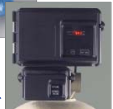
2900NT WITH COVER ▶