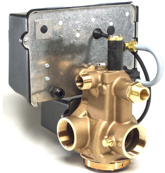
Valve shown with treated water regeneration adapter

Elizabeth Beasley Technical Communications