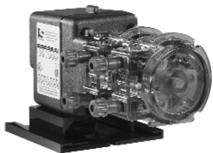
Double Head: Fixed Rate