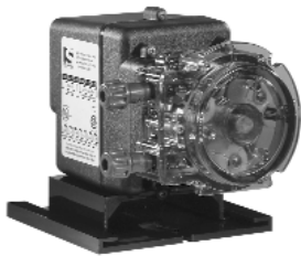
Single Head: Fixed Rate