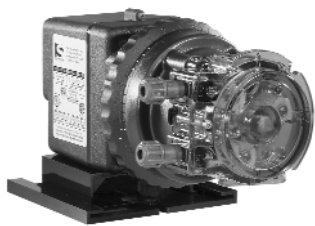
Single Head: Adjustable Rate