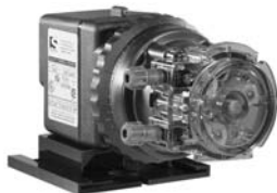
single head adjustable output