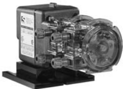
double head fixed output