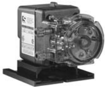
single head fixed output