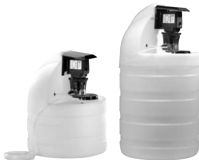
Ships preassembled for convenience and easy installation