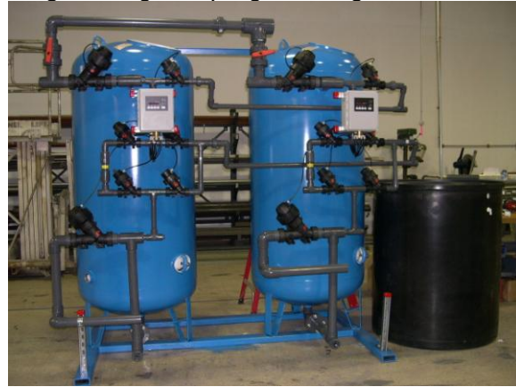
Dual 36" Diameter Dealkalizer System with Optional PVC Diaphragm Valves and Piping

Economical and efficient, Res-Kem Zeo-Tech Dealkalizers can be equipped for manual, semi-automatic, or full-automatic operation. Regardless of the configuration, only limited technical expertise is required for operation. Res-Kem Zeo-Tech Dealkalizers will integrate into a complete water treatment system without expensive custom field engineering and programming.