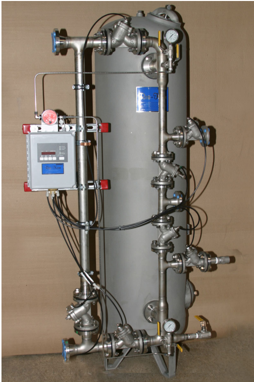
Figure 1 Initial Design of Condensate Polisher

credit market. Almost immediately, the university comptroller put the project on hold and demanded an even higher return on investment in order for the project to proceed. In an attempt to move the project forward, it was decided the university utility manager would work directly with the condensate polisher manufacturer and the winning bid mechanical contractor to see how best to value engineer the product offering. The targeted goal of the value engineering team was to reduce the purchase price of the condensate polisher by a minimum of twenty percent. This together with some labor saving initiatives taken on by the mechanical contractor installing the system would hopefully rescue the project.